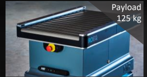
TR125 Manual/Auto 250