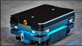
MiR Shelf Carrier