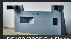
DS100/200E Ext Floor