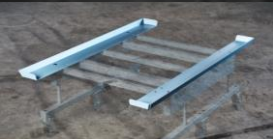
S-Cart300 Rails US/EU