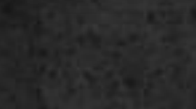
Cart300 Rails US/EU