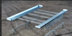
S-Cart300 Rails US/EU