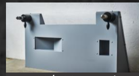
DS100/200P Ext Floor