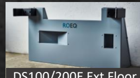
DS100/200E Ext Floor